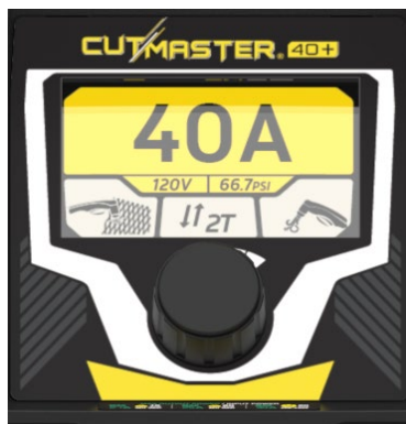
Simple and intuitive TFT LCD panel