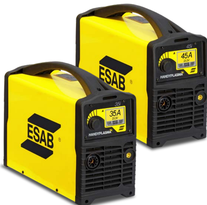
HandyPlasma 35i / 45i