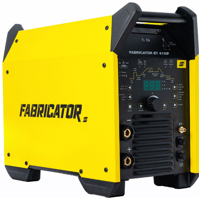
Fabricator ET 410iP